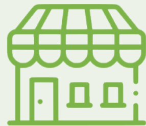
Markets & Fairs